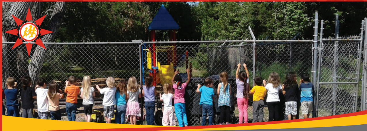
OPEN! OPEN! OPEN! Children at the Small World Child Care Center anxiously await to enter their new playground.

Workforce Solutions of the Coastal Bend (WFSCB) utilized funding designed to support and enhance the "quality" of services at child care centers located in local military communities. Equipment and resources that improved the outdoor learning environments at four child care centers were purchased with these funds. "New" playground structures were placed at child care centers in Corpus Christi and Kingsville, Texas - A Bar Z Ponderosa I; Bundles of Care; Small World; and Smart Planet. These child care centers also received age appropriate bicycles and helmets; sensory tables; and other items to increase students' physical activities.