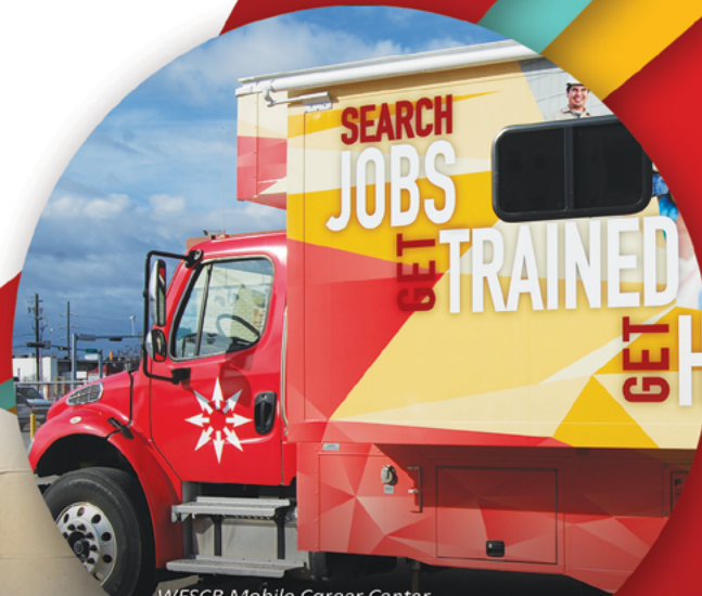
WFSCB Mobile Career Center Ribbon Cutting Ceremony February 21, 2019