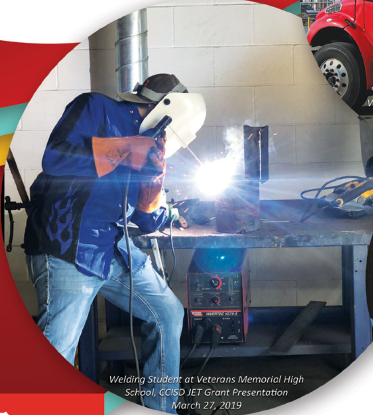
Welding Student at Veterans Memorial High School, CCISD JET Grant Presentation March 27, 2019