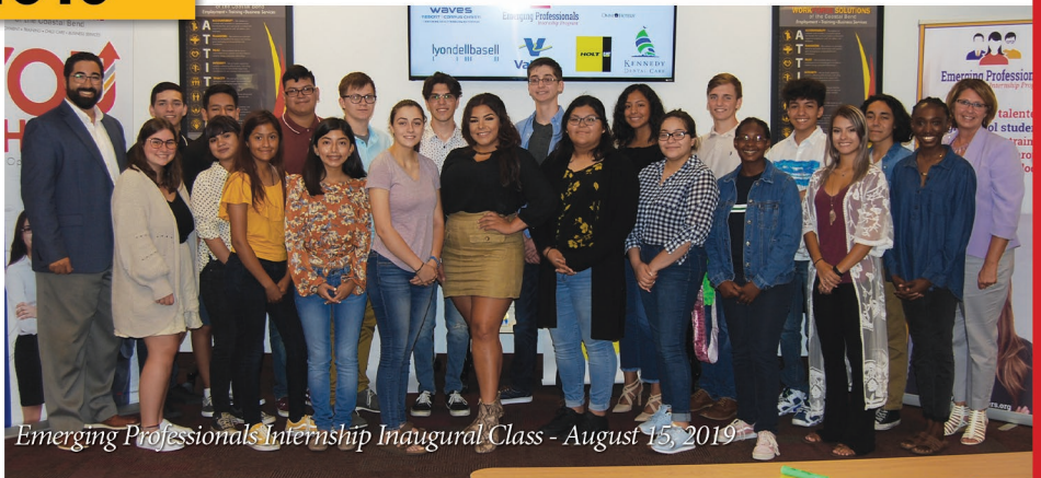
Emerging Professionals Internship Inaugural Class - August 15, 2019