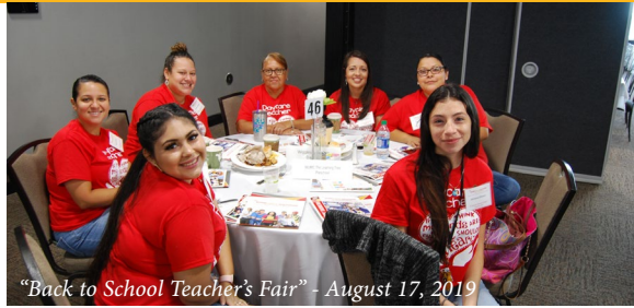
"Back to School Teacher's Fair" - August 17, 2019