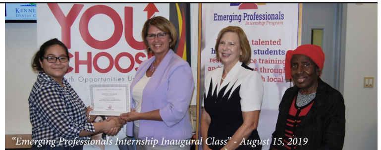
"Emerging Professionals Internship Inaugural Class" - August 15, 2019

August 15, 2019 - Twenty-two high school seniors were honored at the Staples Career Center as they received their Certificate of Completion. Students learned valuable soft skills and gained insight into various in demand industries and occupations across the Coastal Bend region.