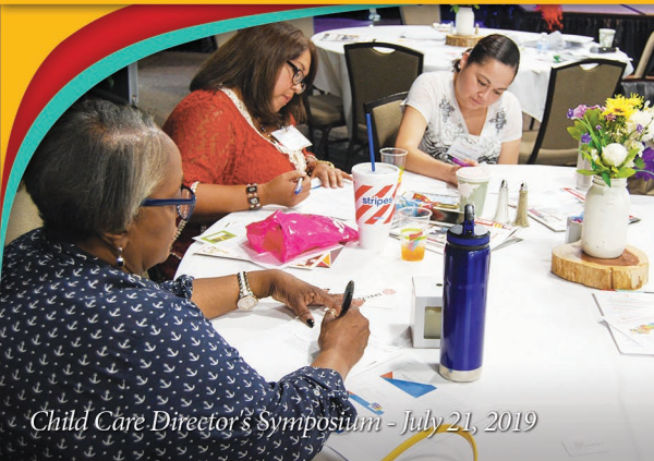
Child Care Director's Symposium - July 21, 2019