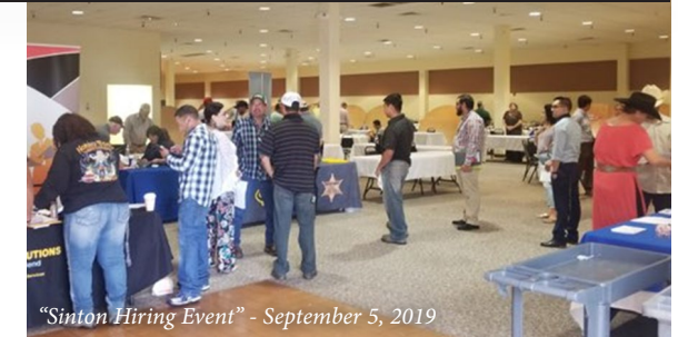
"Sinton Hiring Event" - September 5, 2019

August 27-28, 2019 - Thousands of job seekers showed up for the Corpus Christi Army Depot (CCAD) Hiring Event at the Sunrise Career Center on August 27th. Over 3,500 job seekers were interviewed with many receiving job offers on-site during this 2 day event.