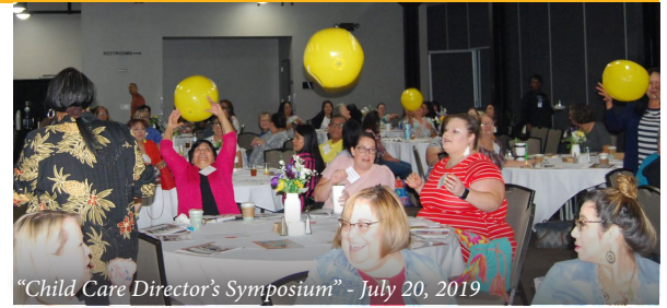
"Child Care Director's Symposium" - July 20, 2019

August 17, 2019 - Educators from the Coastal Bend region received quality training and resources to promote early physical, emotional, social, and intellectual development of children. Over 400 educators attended this event.