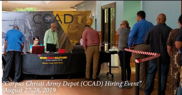
"Corpus Christi Army Depot (CCAD) Hiring Event" - August 27-28, 2019