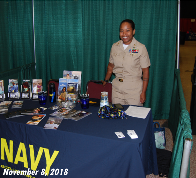
NAVY November 8, 2018