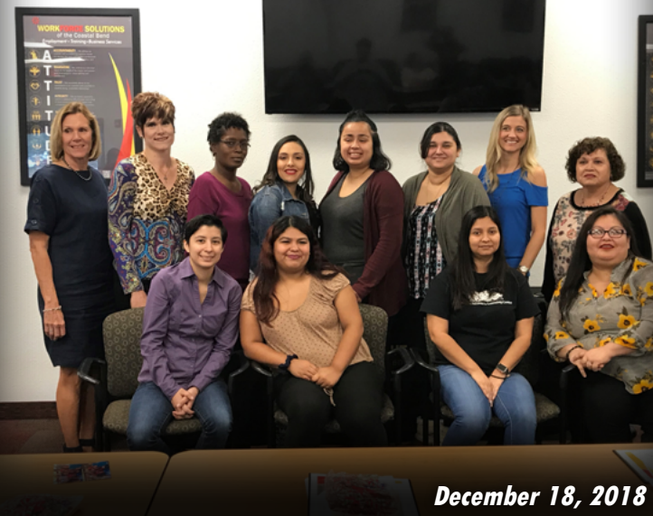
December 18, 2018

Workforce Solutions of the Coastal Bend (WFSCB) held a reception on December 18, 2018 in honor of 10 recipients who graduated from its 6 th Annual Child Development Associate (CDA) Credential Training Program . The 10 week-long professional development training program awarded these hard working Child Care Providers with Certificates of Completion from WFSCB and Coastal Bend College. Congratulates to the Child Care Providers who completed the training to better educate our future workforce by providing them with the skills to be "school and life ready".